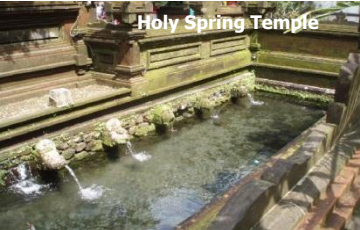
Holy Spring Temple