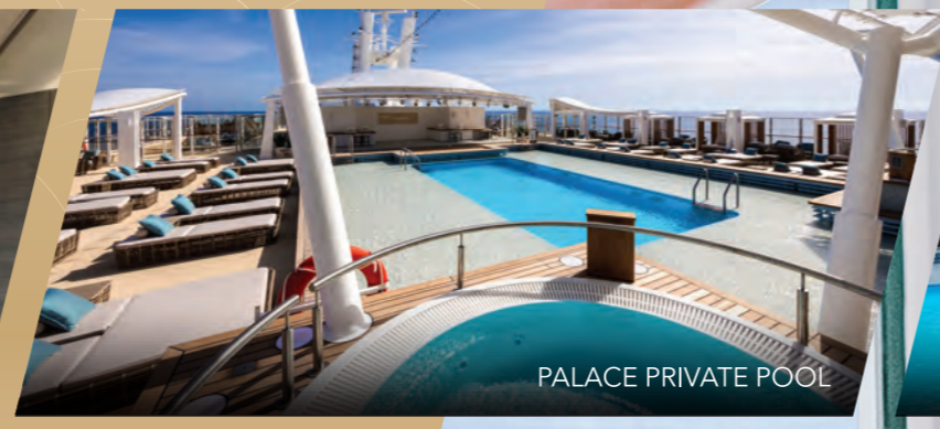
PALACE PRIVATE POOL