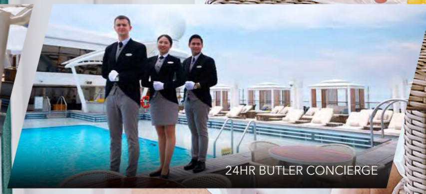
24HR BUTLER CONCIERGE