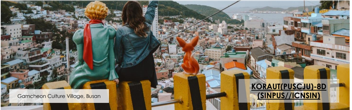
Gamcheon Culture Village, Busan