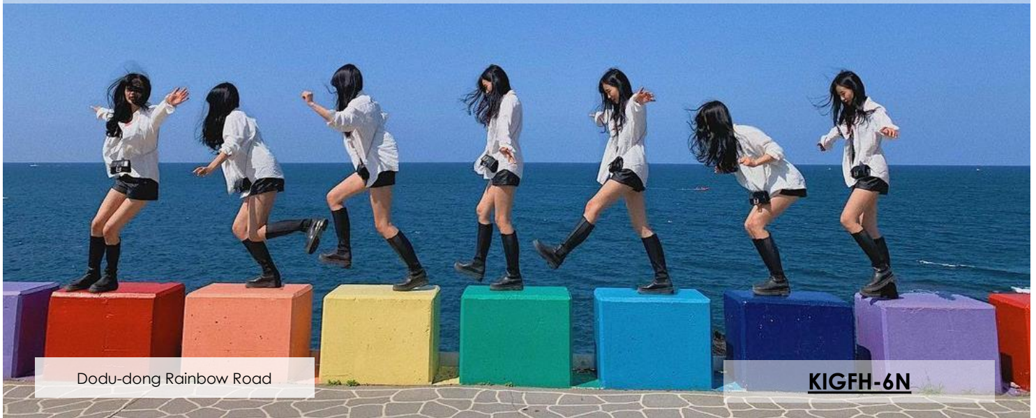
Dodu-dong Rainbow Road