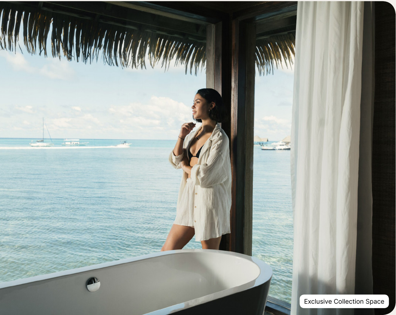
Exclusive Collection Space