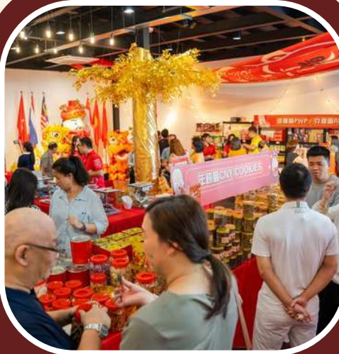
HOCK WONG CNY FACTORY OUTLET 福王年货城