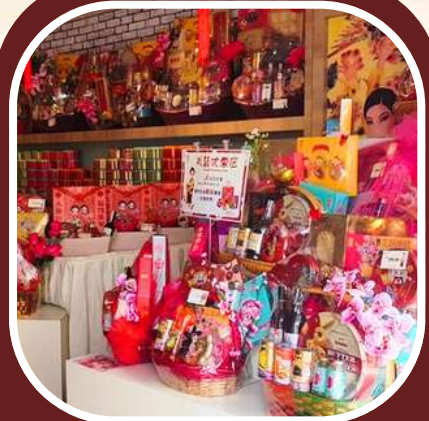
YONG SHENG GIFT SHOP 荣成礼坊