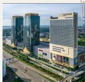
Mid Valley Southkey