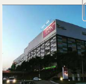
AEON Tebrau City