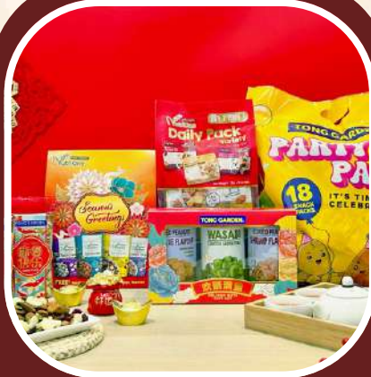
TONG GARDEN FACTORY OUTLET 东园果仁厂