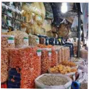
Shang Wan Hong 上环行海味专卖店