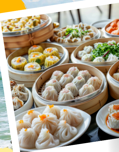
SUCKLING PIG / DIM SUM