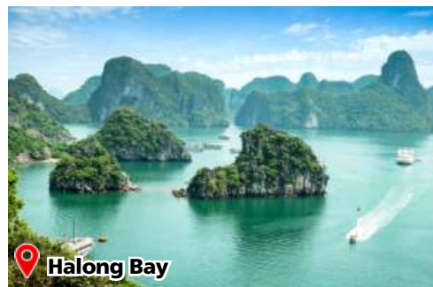
📍 Halong Bay

Transfer to the airport for your flight home!