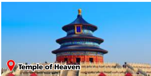
Temple of Heaven

Hotel: Hampton by Hilton Hotel 5★ or similar