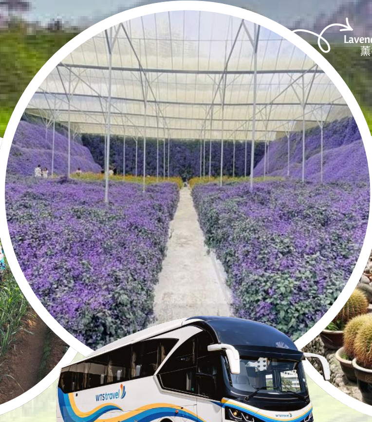
Lavender Garden 薰衣草园