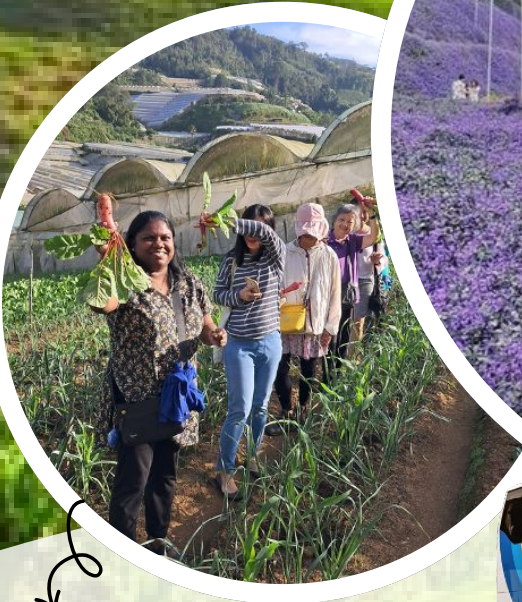
Vegetable Farm 蔬菜农园

* Room Surcharge S$50 per room 每房附加费S$50 | ^ Room Surcharge S$100 per room 每房附加费S$100