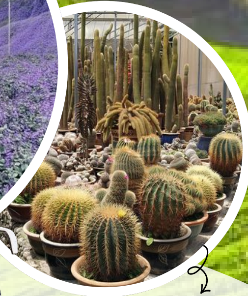
Cactus Point 仙人掌园